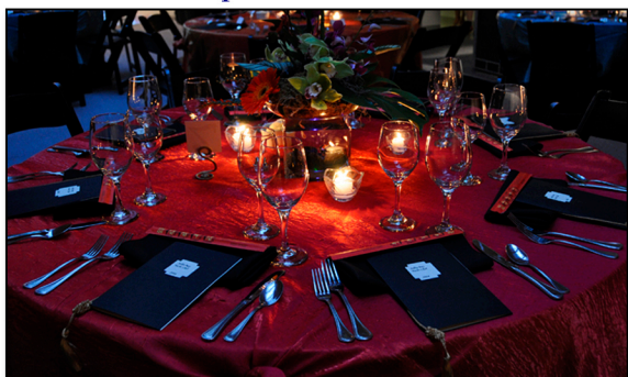
Beautiful Ballroom and Club-sponsored Social Events