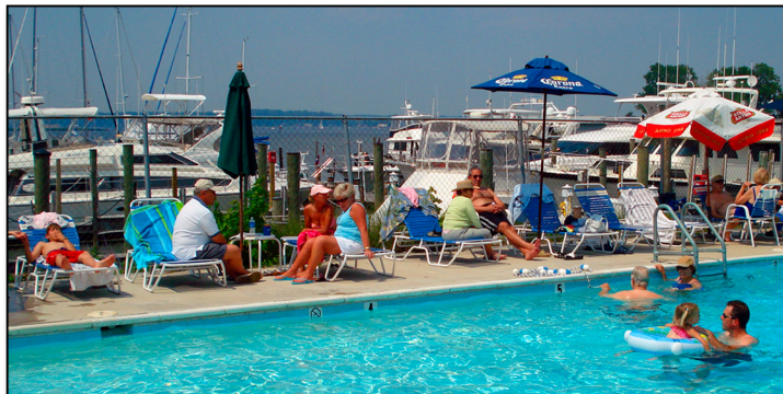
50' Swimming pool with lifeguard