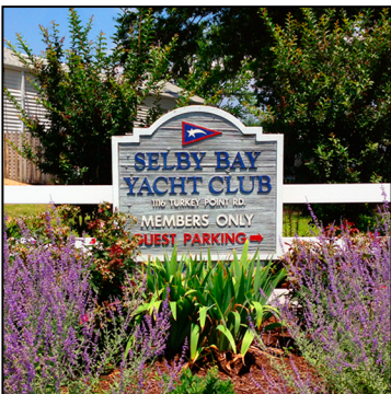
Meticulously maintained, landscaped grounds